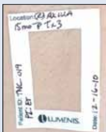
Axilla 15 months after three LightSheer Duet HS treatments

Are there other devices that use the same basic reduced-fluence principle?