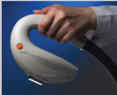
Revolutionary Universal IPL® Treatment Head

internet: www.lumenis.com email: information@lumenis.com