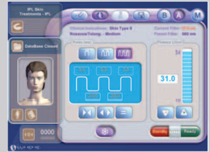
Advanced Mode Treatment Screen for IPL® Skin Treatments