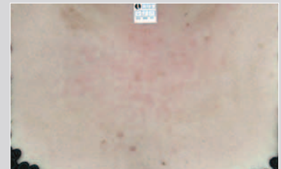
After 1 treatment