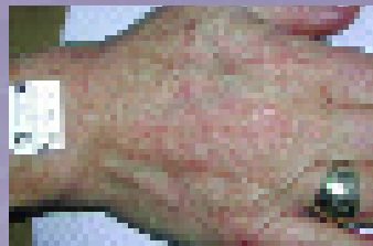
After four IPL treatments using the Elora