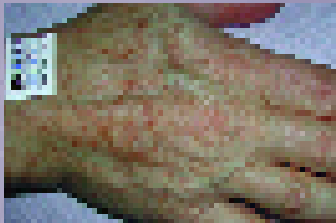
Before lentiginos on the hand

The Elora intense pulsed light system treats a broad range of applications safely and effectively. This small, portable and simple-to-operate system readily integrates into any practice.