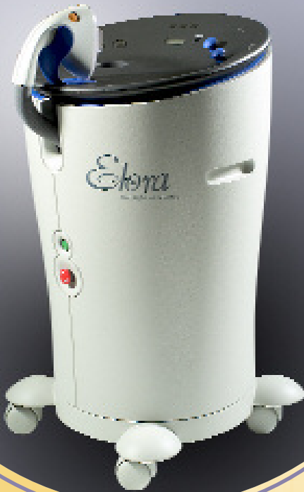
Elora Dual-Mode IPL System